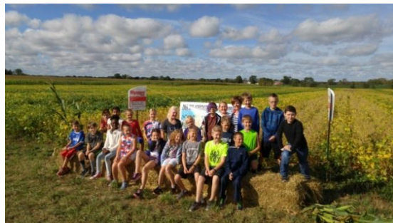
Couple of the 4 th grade groups