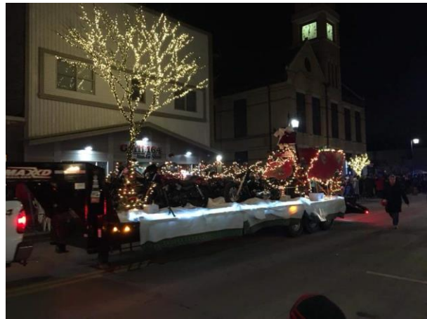
PICTURE OF LAST YEARS SANTA'S SLEIGH

THE PARADE COMMITTEE AND THE CLUB MADE A GREAT DECISION A COUPLE OF YEARS AGO TO MOVE IT TO THE EVENING !!!