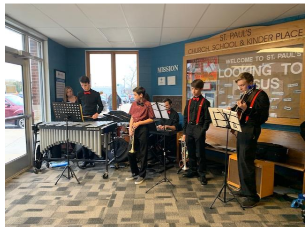
Members of the Wind Symphony Playing in the lobby. They really appreciated coming and getting the