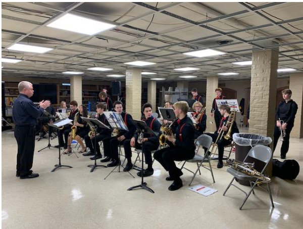
JAZZ BAND IN THE FELLOWSHIP HALL