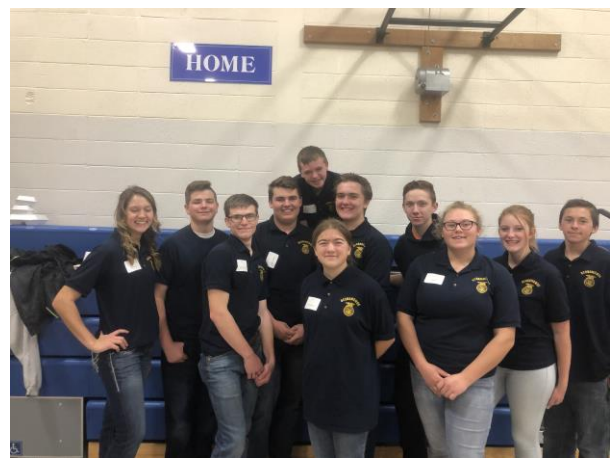
FFA- Not pictured –Marge Waite