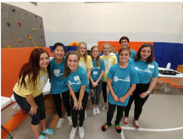
KEY CLUB 2 ND SHIFT