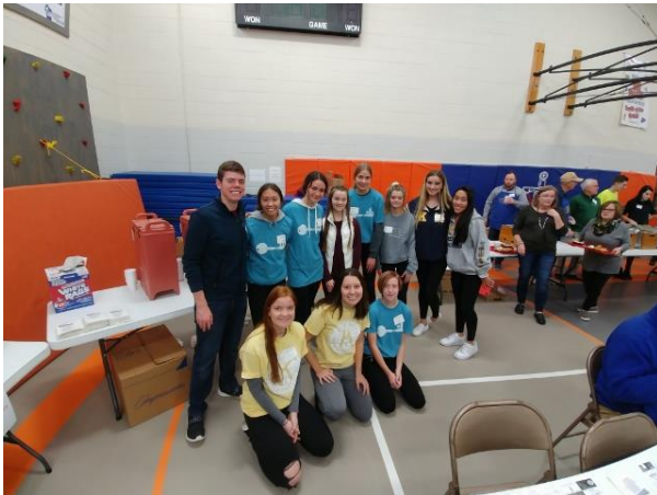
1 ST SHIFT KEY CLUB