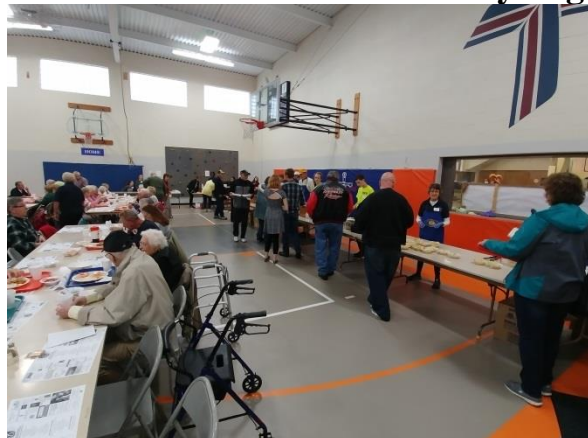
Steady crowd all day